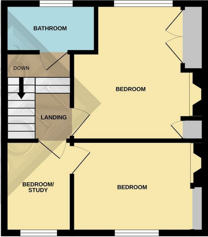
TOTAL FLOOR AREA : 785 sq.ft. (73.0 sq.m.) approx.

Whilst every attempt has been made to ensure the accuracy of the floorplan contained here, measurements of doors, windows, rooms and any other items are approximate and no responsibility is taken for any error, omission or mis-statement. This plan is for illustrative purposes only and should be used as such by any prospective purchaser. The services, systems and appliances shown have not been tested and no guarantee as to their operability or efficiency can be given.